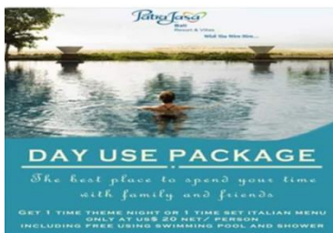
Figure. 1. The Parta Bali Resort and Villas

Data 1: The Parta Bali Resort and Villas