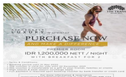
Figure. 8. The Trans Resort Bali

The next visual sign in the advertisement is color, the first is green the color of growth, spring, renewal and rebirth (Cerrato, 2012:5). The green color in the hotel is a color that regenerates like a newly opened hotel and will provide a place to relax for many people. The second color is white, white color is the color of perfection, purity, cleanliness and caution (Cerrato 2012:4). The white color in the advertisement describes the perfection of the hotel that will be provided to visitors with its facilities, as well as providing a clean and comfortable place. The white color in the advertisement describes the perfection of the hotel that will be provided to visitors with its facilities, as well as providing a clean and comfortable place. The last visual sign is "Holiday Inn Express Baruna" the name of product explaining to the reader the name or identity of the hotel in the advertisement.