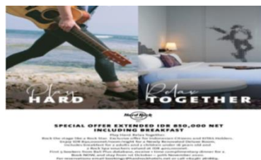
Figure. 3. Hard Rock Hotel Bali

The second is white color that represents purity, snow, purity, cleanliness, security (Cerrato, 2012:4). The white color in the hotel is a perfect thing provided by the hotel through the security and cleanliness in the hotel. The three visual sign in the advertisement is 5 stars, which explains to the reader that the hotel in the advertisement is a five-star hotel, with the star image in color yellow. Yellow is the color that joy, happiness, idealism, also will warm and lift the spirit (Cerrato, 2012:6). The yellow color on the hotel means luxury which brings happiness to the visitors during the holidays. The last is Pullman Hotels and Resort The name of the company's tagline that supports the advertisement.