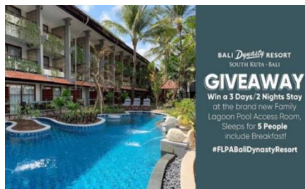
Figure. 6. Bali Dynasty Resort

The next color black appears in the sentence uses capital letters, black color is beneficial for business selling luxury, elegance, and sophistication (Cerrato, 2012:4). The black color in the advertisement describes a luxurious hotel with all the facilities provided for visitors while on vacation. The white color in the advertisement is the color of perfection, purity, cleanliness and caution (Cerrato, 2012:4). White color is the perfection that the hotel gives like a natural state, clean and comfortable. The last visual sign in advertisement is logo, explain to the reader that the flower image contained in the logo represents the identity or name of the hotel, the readers can find out the advertisements on display come from hotels that are found in the logo.