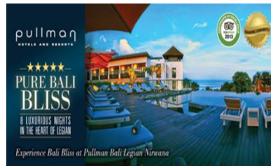
Figure. 2. Pullman Hotels and Resort

The next statement is visual markers appears in the poster is type capital letters used for support verbal sign is the typeface that chosen by the poster creator is the typeface capital that aims to attract attention the reader about the verbal message he wants be delivered. The last statement in visual sign is 'Parta Jasa Bali Resort and Villas logo' the tagline name of the company that supported the advertisement readers can find out the name of the company that published the advertisement.