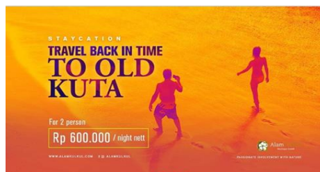
Figure. 5. Alam Kukul Boutique Resort

The next visual sign in advertisement white colour, representing purity, snow, purity, cleanliness, and security (Cerrato 2012:4). The white color in the hotel is a perfect color that provides a nice and comfortable place as well as beauty and cleanliness that is maintained. The second color is black, black is selling luxury, elegance and sophistication (Cerrato 2012:4). The black color in the hotel is something of a luxury that the hotel provides as well as responsibility in the needs of visitors. The last visual sign in advertising is the logo Discovery Kartika Plaza, the logo is the name of the product explains to the reader so that visitors know the name of the hotel contained in the advertisement.